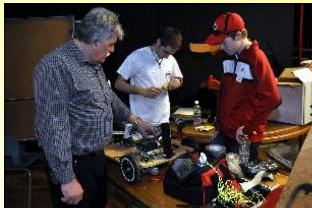
Robotics Competition - An advisor supports students competing in the robotics competition. Gold medallists in Skills Canada Provincial Competitions were offered the opportunity to form Team Newfoundland and Labrador and travel to Quebec City for the National Competition.