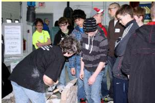
Brick Masonry Demonstration - Those who toured Annual Skilled Career Day events in Pippy Park had the chance to Try-A-Trade®. These students experienced bricklaying and also had the chance to try auto service, carpentry, plumbing, precision machining, painting, decorating, welding and more.