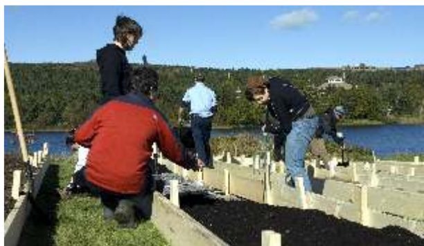
Memorial University students and volunteers work to create Pippy Park's newest community garden on the campus of Memorial University, behind Queens College on the shores of Long Pond.

Added to this is a new public awareness that, because we are an island, in the event of transportation