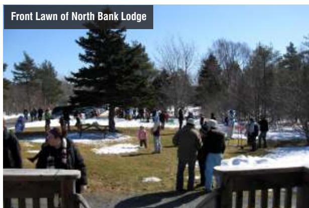
Front Lawn of North Bank Lodge