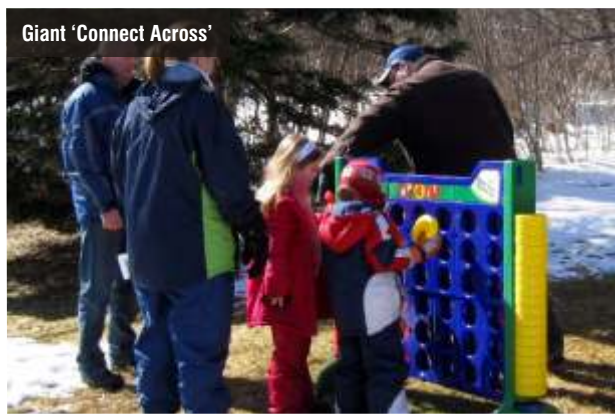
Giant 'Connect Across'