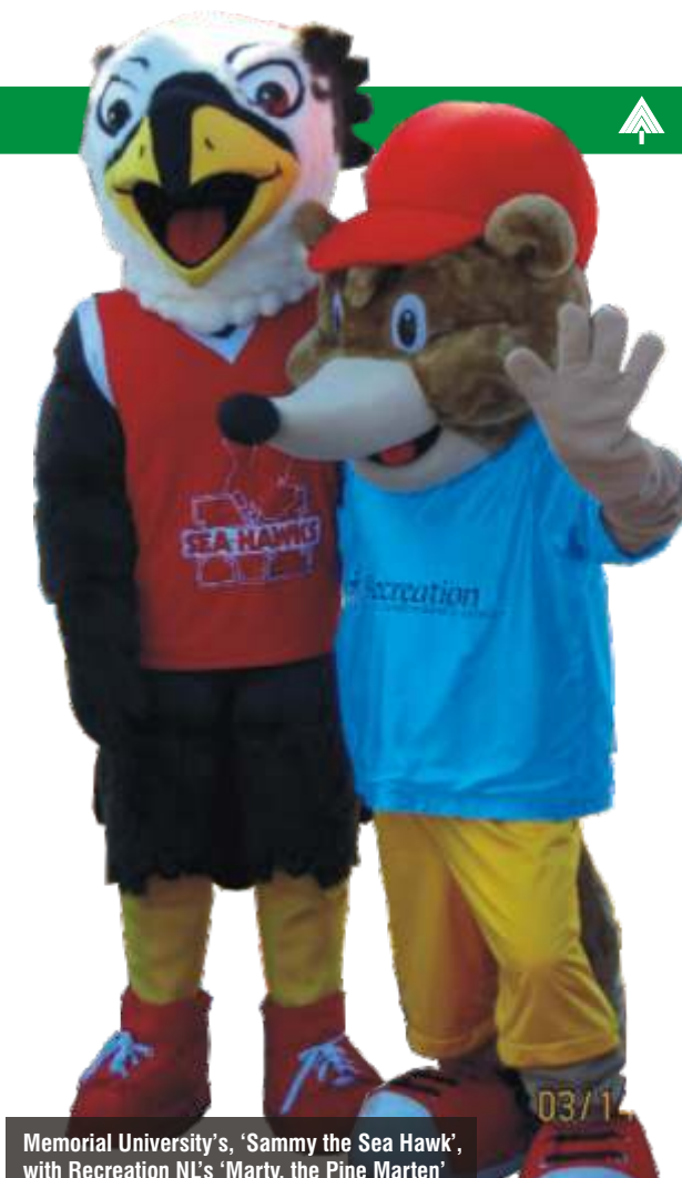
Memorial University's 'Sammy the Sea Hawk', with Recreation NL's 'Marty, the Pine Marten'