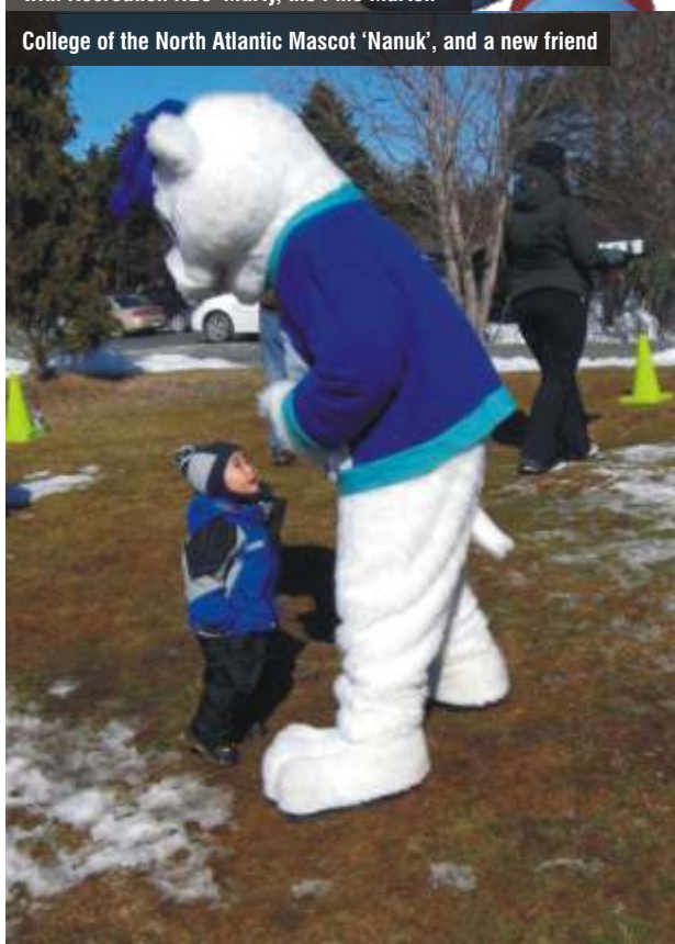
College of the North Atlantic Mascot 'Nanuk', and a new friend