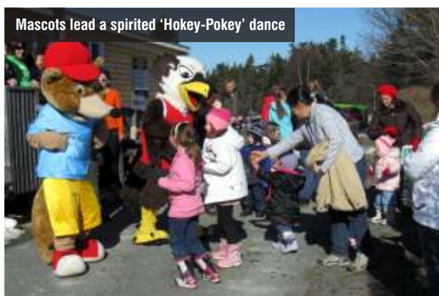
Mascots lead a spirited 'Hokey-Pokey' dance