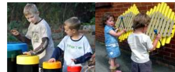
Photos: Tuned Drums (left) and Imbarimba (right).

The Autism Society of Newfoundland and Labrador is pleased to announce that they will construct a musical garden on the grounds of the Elaine Dobbin Centre. The Rotary Harmony Garden is being funded by the Rotary Club of St. John's Northwest. They will be raising the funds for the Harmony Garden and the Penney Family Y at the Rotary Northwest Annual Gala Dinner on Friday April 23, 2010.