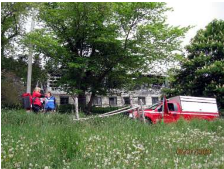
What remains of the the barn at the historic O'Brien Farm on Oxen Pond Road following the fire of Monday, June 8.