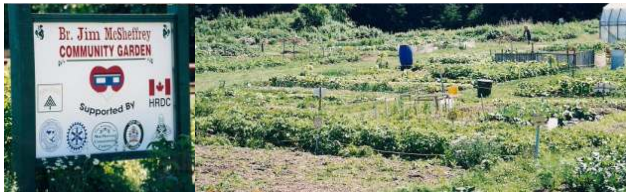
Surplus organic material from the Outer Ring Road project which was unsuitable for road construction was used elsewhere in Pippy Park on many projects, including at The Frolic, now home to the MacMorron Centre Community Garden. [above]

Some benefits arising from the Environmental Advisory Committee and the Outer Ring Road Construction