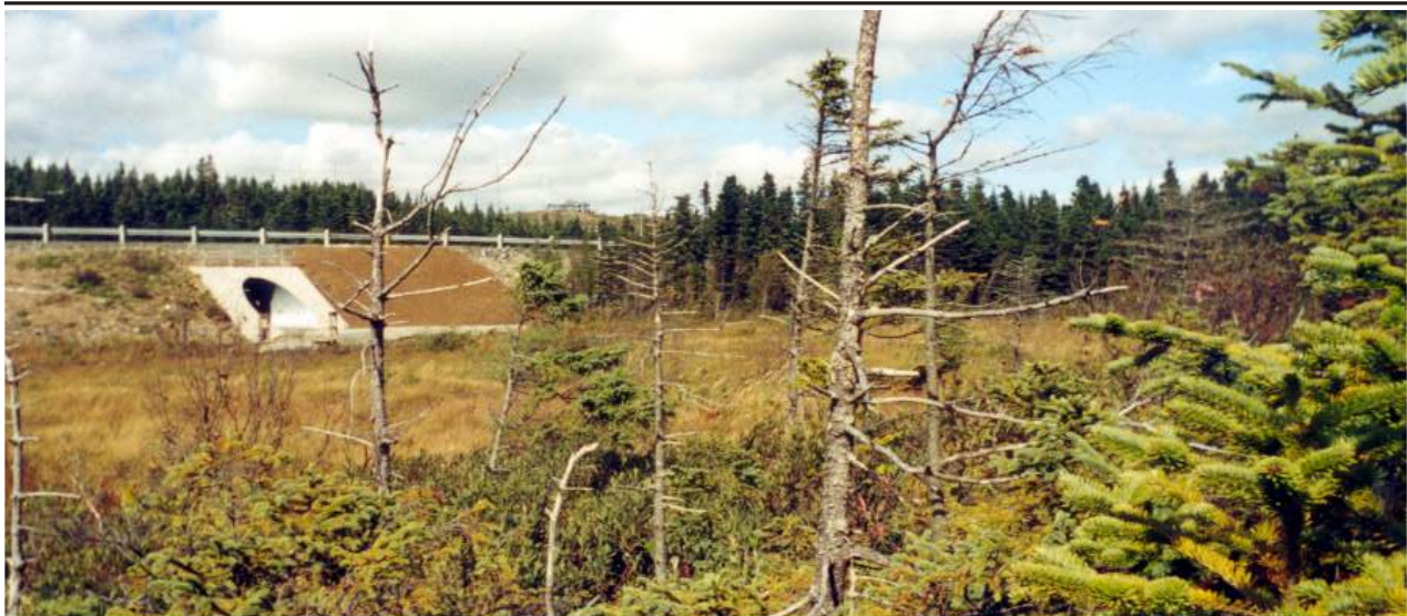
Outer Ring Road Pedestrian Underpass at Fogarty's Wetland, one of three such structures located within Pippy Park. These underpasses allow trail connections to be maintained within the park.